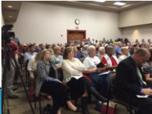
Hood County Court Hearing 7/14/2015